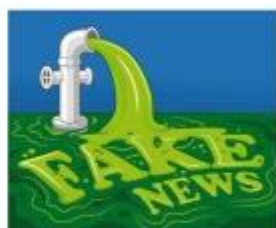
A Parent's Guide to Fake News