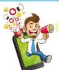
A Parent's Guide to Live Streaming

scan the QR code with your phone's camera to see the guides on our website